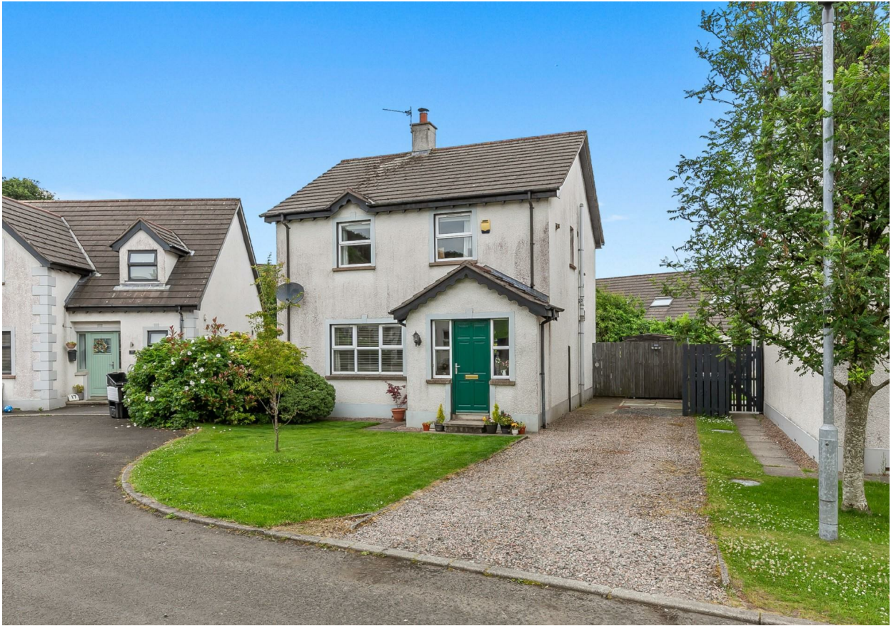
15 Village Hill, Straid, BT39 9WQ